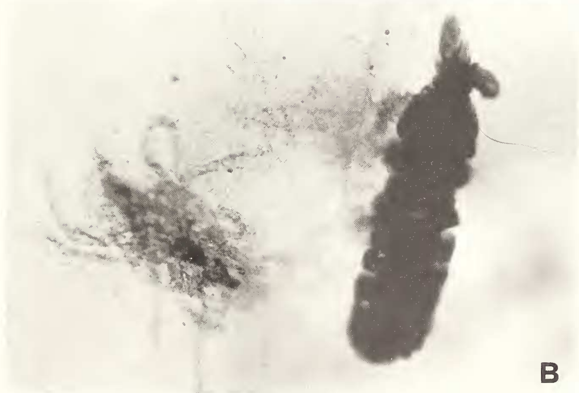
TEXT-FIG. 1. A, chernetid pseudoscorpion (deutonymph) from Cretaceous Canadian amber; body length (with chelicerae), 1.35 mm. B, mite (left) and juvenile insect larva or collembolan (right) from the same piece of amber as the pseudoscorpion; body length of the mite about 0.4 mm.